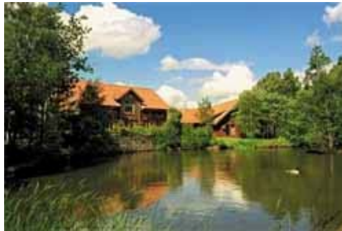
Chevin Country Park Hotel Yorkgate, Otley, LS21 3NU